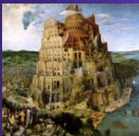
Pieter Bruegel the Elder, 1563